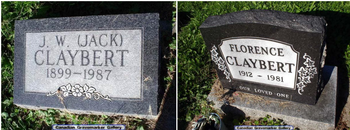
Lakeview Cemetery, Town of Cold Lake, Bonnyville Municipal District, Alberta 74